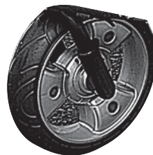
(1) Front Wheel