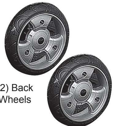
(2) Back Wheels