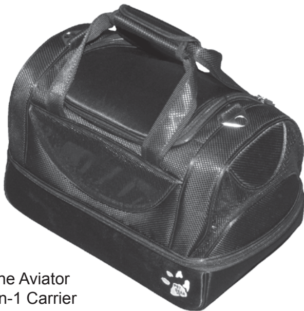
The Aviator 3-in-1 Carrier

Check that you have all the parts shown BEFORE assembling your product. If any parts are missing, call Customer Service. No tools required.